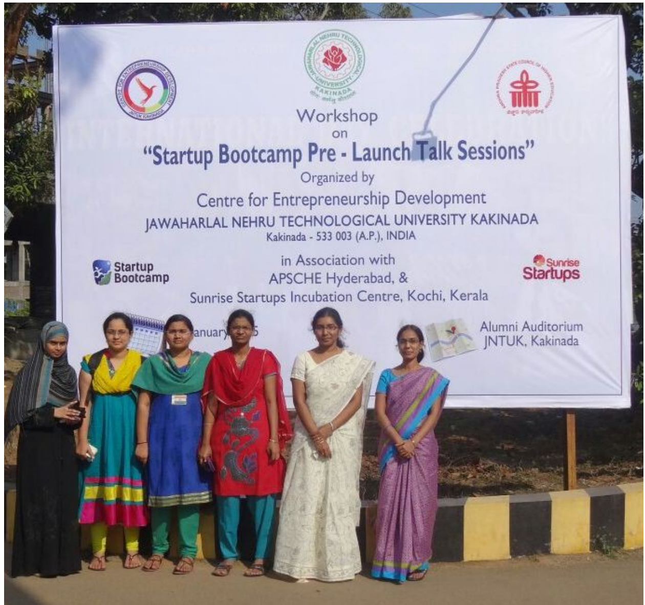
Prelaunch Talk Session at JNTUK, Kakinada

Memorandum of Understanding (MoU) between the colleges and Pilot Incubator on the establishment of Bootcamps in all colleges in Andhra Pradesh.